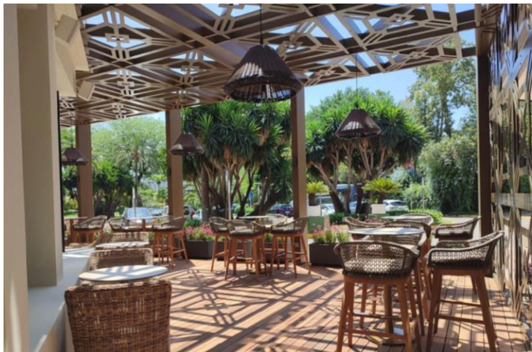
Photo of the Terrace at “Sherry Vermouth Bar” in Hipotels Sherry Park Hotel